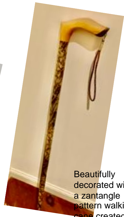
Beautifully decorated with a zantangle pattern walking cane created by Barry Spillman