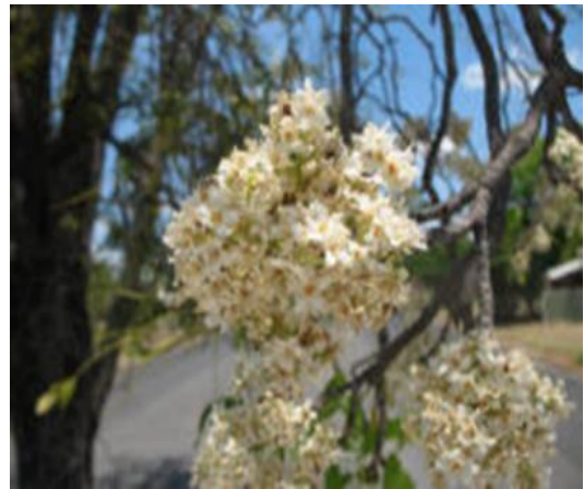
Fowering making an impressive sight