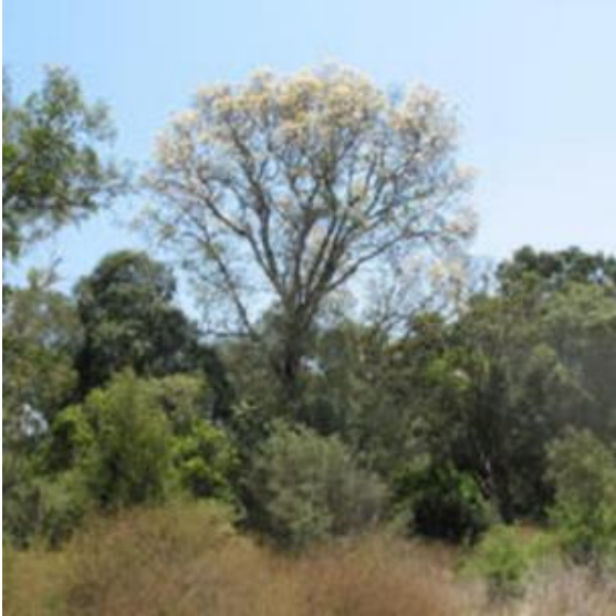
Crows ash drops its leaves in Spring

The majority of this valuable timber has been logged out many years ago. Crows ash timber is hard and moderately heavy and has been extensively used in construction, particularly for flooring where its greasiness has made it excellent as a dance surface. This greasiness causes problems with gluing and nailing, but can be overcome. The timber tends to check a bit while drying.