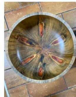
Two current creations of Ken a NE form with the pith cracks filled with silver tinted resin and a large Norfolk Island pine bowl.