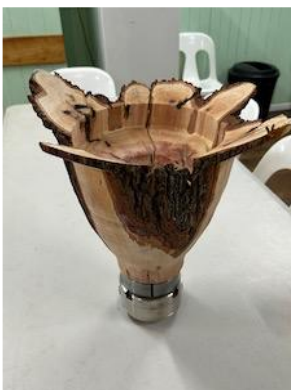
A roadside find by Ken Rays. A nice piece of she oak. It needs some immediate attention to finish turning before it starts to split.