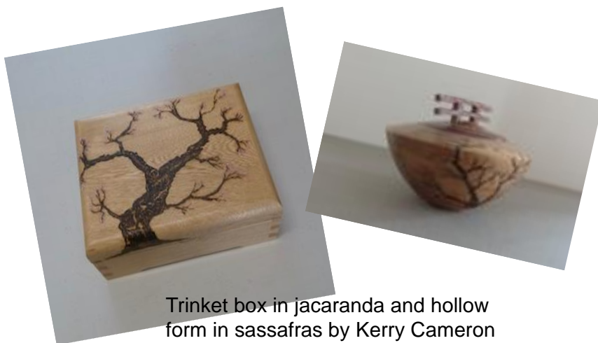
Trinket box in jacaranda and hollow form in sassafras by Kerry Cameron with a Japanese styled cherry tree pyrographed as decoration