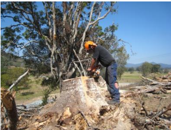
Kerry Cameron harvesting from a stump near Dayboro.