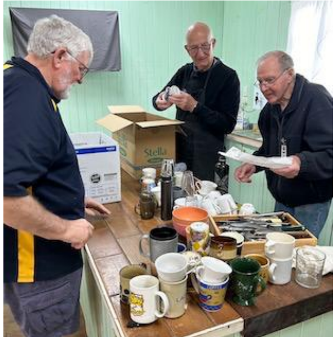
Accumulated excess cups from past and present members being sorted for the new kitchen fitout.