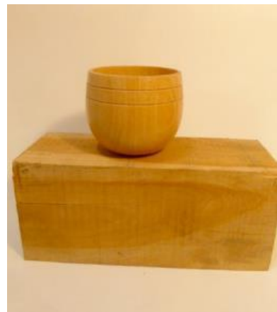
A small Calabash style bowl turned from a section similar to what it stands on

As a turning timber, Crows Ash machines quite well as long as tools are kept sharp but it is a pain to sand although wet sanding gives a good result. The best finish is Danish Oil.