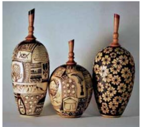
Hollow forms by Thys Carstens (South Africa) decorated with pyrography.